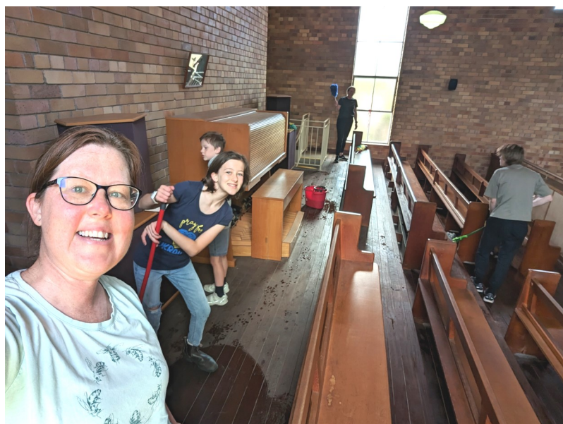
Working Bee at St Cecilia's before the Christmas rush.